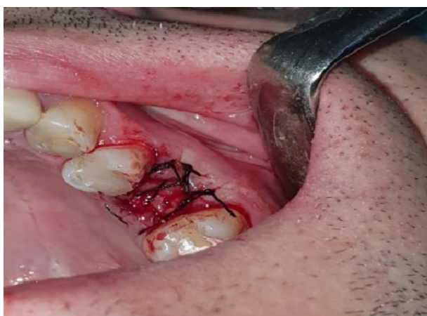
Picture 5. Stabilization suture

The PRF plug was gently placed in the socket using a PRF plugger, followed by the application of the PRF membrane. Finally, a stabilizing suture was applied (Picture 4).