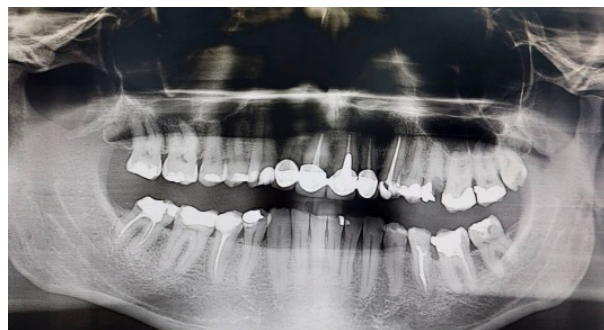
Picture 1. Orthopantomography

(Biobase LC-H4K centrifuge, BIOBASE, Jinjan, Guangdong, China), using the A-PRF+ protocol on 1300 rpm/8 min (Picture 2).