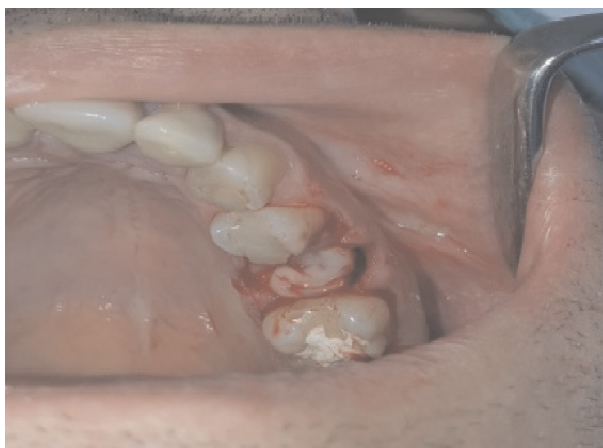
Picture 4. PRF plug and membrane application