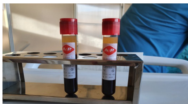
Picture 2. A-PRF tubes