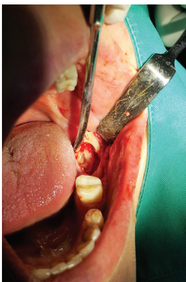
Figure 6. Transversal section of the crown