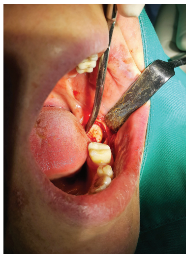
Figure 5. Peri coronary bone removed to the cemento-enamel junction