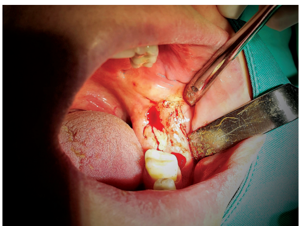
Figure 3. Triangular flap extended medially