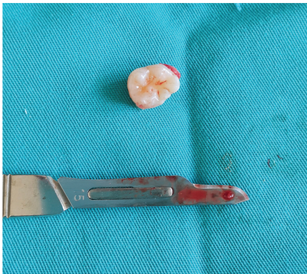
Figure 7. Detached crown on the surgical table