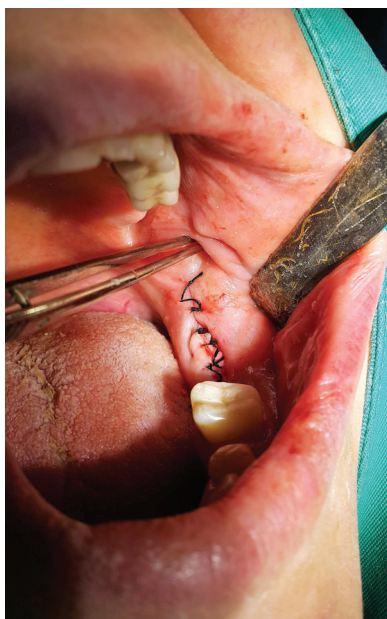
Figure 8. Surgical wound with sutures