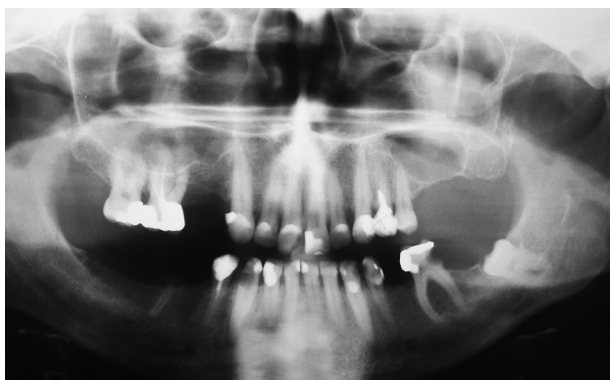
Figure 2. Patient's orthopantomogram depicted deeply impacted left mandibular third molar with multipart root complex superimposed and extended beyond the lower rim of the mandibular canal