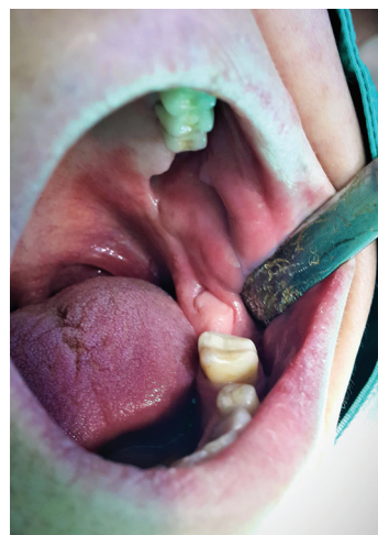
Figure 1. Intraoral view of the left posterior mandibular quadrant with semilunar split in the crestal aspect of attached gingiva with normal color.

A 42-year-old female patient was referred to the University department of oral surgery for removal of an unerupted tooth in the lower jaw due to the need for lower denture. She didn't have any complaints regarding the tooth in question. The patient was in good general health, without any co-morbidities. Clinical examination revealed continued mandibular front, from right premolar to left first molar. In the most posterior aspect of the left mandibular quadrant, a semilunar split in the attached gingiva was evident (figure 1).